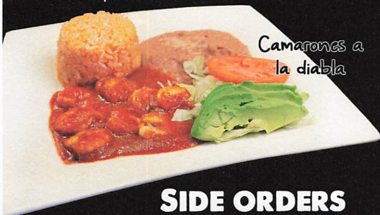
Camarones a la diabla

Fried Tilapia. Served w/ avocado salad & cucumber